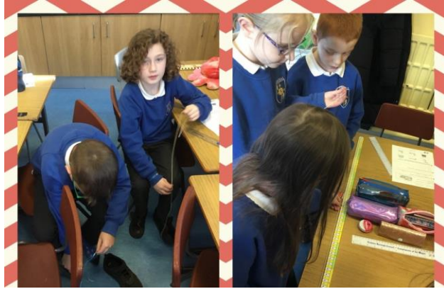
2 - P.5 measuring activities